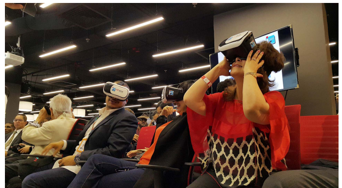
Fig. 7. Example of a figure caption.

The final result of the prototype in the form of 360 video have been used for a corporate event launch as an experimental use case as shown in Figure 7 and Figure 8.