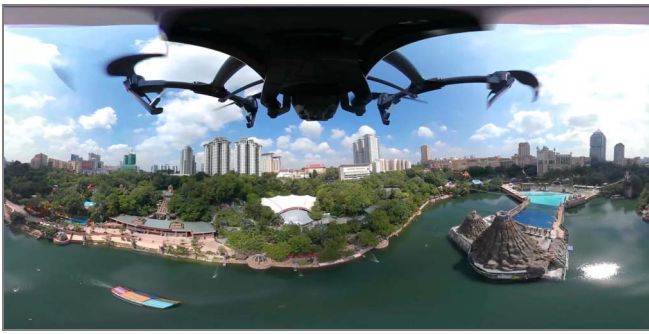
Fig. 4. Stitched image from the Samsung Gear 360.

The drone's flight movement was standard manoeuvre of a basic fly over the point of interests, taking off and landing. Height of the drone is also capped at 100 metres to maintain light of sight with the pilot. The challenge on this 360-degree video is not being able to see the results until it has been stitched. [5].