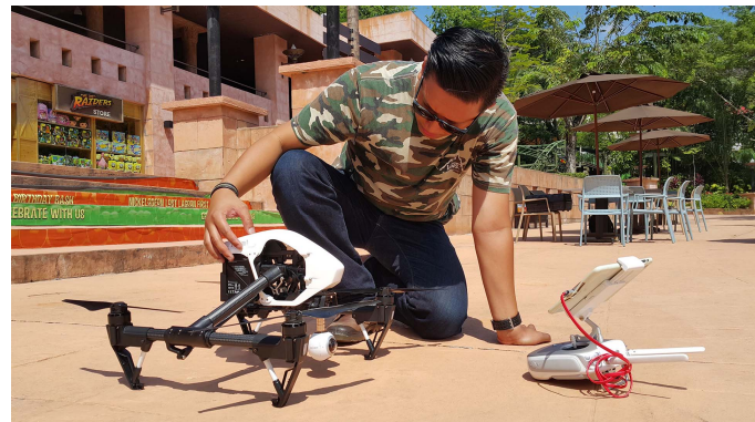
Fig. 3. Pre-flight check.

The camera was mounted where the drone's camera is placed. With this, the pilot was flying relying only on line of sight of the drone, and the GPS positioning of the drone that was viewable on the monitor.