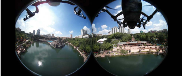
Fig. 1. Dual lens raw footage.

Manufacturers of 360-degree cameras can now be found anywhere. From Ricoh Theta, Insta 360 to Samsung Gear 360. All of these cameras are consumer level cameras that can be found anywhere for a very affordable price. These cameras are designed with dual fisheye lenses that is placed in opposite direction. The camera will then record simultaneously and resulted in a side by side footage of two lenses as per Figure 1.