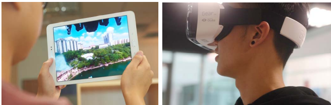
Fig. 9. Aerial 360 video with mobile tablet and HMD user experience.

experience the aerial 360 content with the assistance of an experimenter. The experiment conductor explained the processes and provided a complete demonstration. Each participant completed the tasks in about 3 minutes. We used a within-subject experimental design. Participants were requested to experience the content twice in two conditions in random sequence. The two conditions involved using a 10.1 inches Android tablet (Samsung manufactured Tab 2 GT-P5100), and also experiencing the HMD configuration shown in figure 9 (using mobile computing device of Samsung S7 Edge G935FD [6]). After running the trials we got participant feedback on how easy it was to use the system. This was done by collecting qualitative feedback in response to the questions shown in table 1. Answers were captured on a Likert scale of 1 to 7 in which 1 was “strongly disagree” and 7 “strongly agree”. Our key interest was to understand the perceived ease-of-use and usefulness of the prototype by the participants, and how they described their experience with our system.